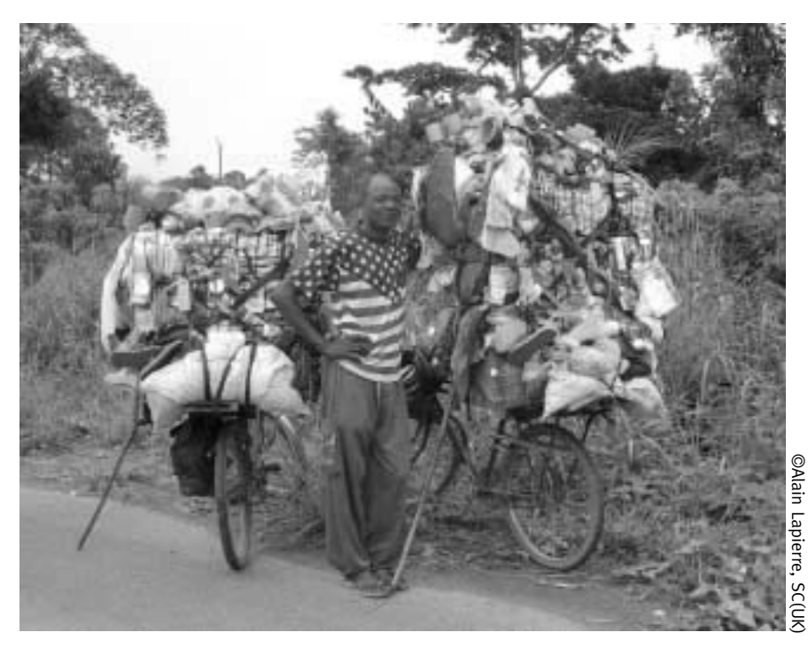
A trader in Eastern DRC

The drought caused the loss of around half the harvest in mid-2000. 12 As people turned more to the market for food, prices for some staples doubled, and the price of labour dropped. Poorer households resorted to temporary migration to Rwanda (where labour rates were higher), planting crops in the marshlands, harvesting early, selling crops pre-harvest, reducing consumption to one meal a day, cutting essential health expenditure and going into debt. The number of people without any livestock more than doubled between August 2000 and January 2001.