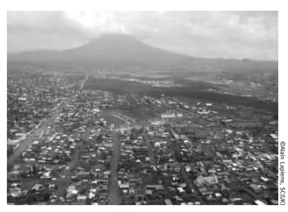
Goma after the eruption, 2002

A one-week general food ration was distributed to most households within five days of the eruption. Repair work on roads cut by lava began quickly, re-establishing trade across the town within two to three weeks, and allowing food to