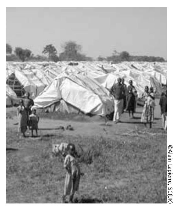
A camp in northern Uganda, 2003/2004

The cases for this paper were selected in part because sufficient assessments had been done to allow identification of the main constraints to household food security. Therefore, in terms of assessment and analysis, the cases are neither typical nor representative of the average case in the Great Lakes. Kasese is probably closer to the average level of understanding of constraints to food security, in the sense that little was known about the exact nature and scale of the problems encountered by the population.