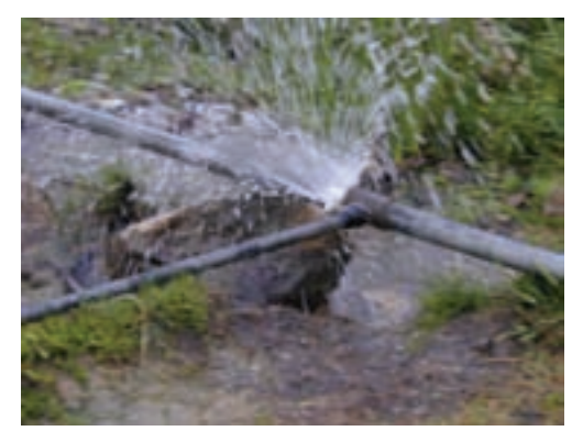
East Timor. Illegal Connections.