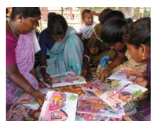
Three pile sorting.

During the response to Cyclone Sidr in Bangladesh, an inventive engineer came up with a useful way to help to manage and resolve complaints. The selection criteria for the provision of shelter was determined in partnership with community groups in order to determine where the priorities were. Photographs were taken of the shelters to be repaired. Several families subsequently complained that they should also have had shelters provided for them. A picture was then taken of their shelter and compared to the shelters of the families that had been selected and this helped to provide both community members and the construction team with a useful way to resolve any differences. (OXFAM personal Communication)