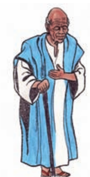
Older people are likely to be disproportionately vulnerable during disasters.

However, some people will be more vulnerable than others and limited resources might mean that aid will sometimes need to be targeted at particular groups and decisions will have to be made by weighing up the pros and cons of each. For example in the case of NFIs, some people may be able to afford to purchase hygiene items but a blanket distribution of soap may be easier to manage and may stimulate increased use which will help to protect the health of the public as a whole.