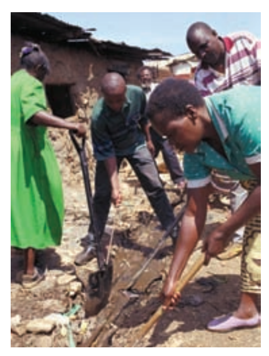
Digging drainage channels.

As part of its Tsunami response programme, HelpAge has produced a detailed social map of all the villages in which it works. Data, collected through village surveys and individual interviews, is represented visually in a series of maps available on CD-Rom. The maps show each house, the type of house (brick, thatch), houses with older people, houses in receipt of programme support and type of activity (e.g. livestock, artisan). Clicking on individual houses gives details of the older person living in that house, including information on health issues. Each social map is available at village level on a 12 x 8 foot canvas. (This idea could be adapted for the WASH sector.)