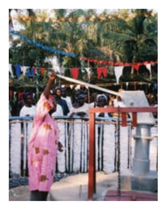
Well opening Sierra Leone.

It should also be remembered that older people have a wealth of experience and knowledge about their communities and can make a significant contribution in both preparing and responding to emergencies: so consideration and thought needs to be given in how to responsibly contact and interact with older people.