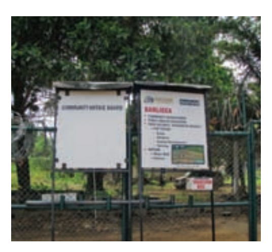
Information board in Liberia.

Communities initially used the ledgers as guest books to record visitors to the community. This made sure that other NGOs were not duplicating efforts but later the communities were trained to use the ledgers to record the movements of project materials. The Committee made sure that any request for materials from project staff details the quantities, output and staff names. This helps to ensure that materials are used for their intended purpose. ( Tearfund 2009 personal communication )