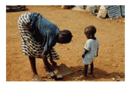
Sierra Leone, IDP camps.