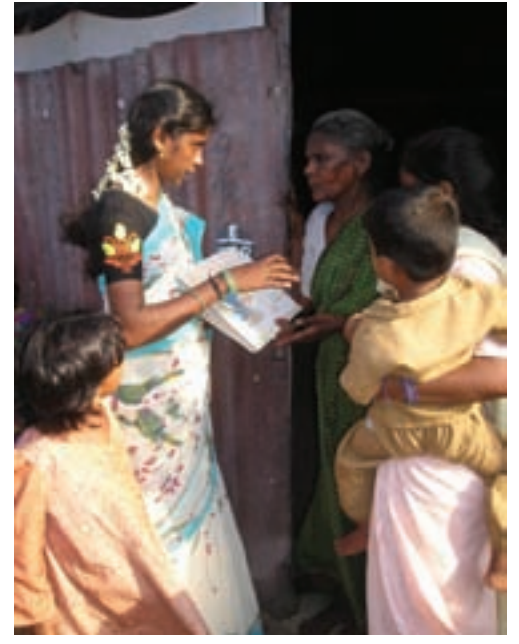
Home visiting