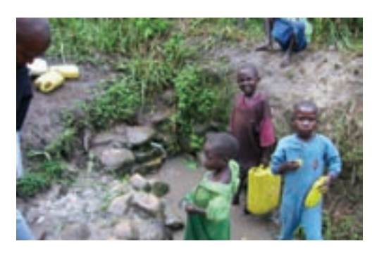
Children collecting water.