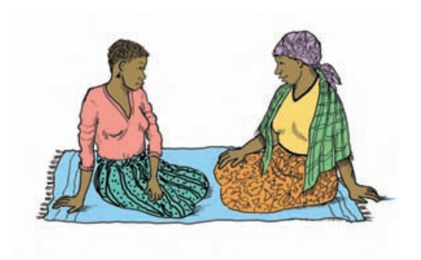
Adapted from Training for Transformation Book 2 Hope, A. and Timmel, S. ITDG Publishing reprinted 2007